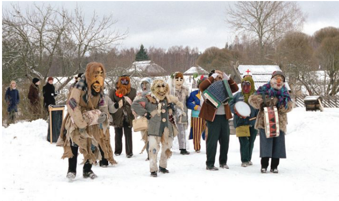
Fig. 2. Present-day character of Shrovetide 'beggars' (Alkas)

the actual lifestyle of the beggar were exploited in the role of the Shrovetide costumed 'beggar'. At all times, more frequent and easily observable negative reasons were given for why the priests of quite a few parishes criticized the costumed processions of Shrove Tuesdays and tried to ban them.