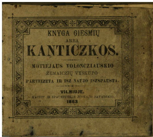
Fig. 5. 'Kanticzkos' by Motiejus Valančius (Valančius 1863a)