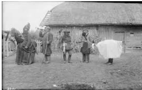
Fig. 1. Costumed Shrovetide characters in Žemaitija (1935)

In the costumed processions held in Žemaitija on Shrove Tuesday, the ‘beggars’ were among the main characters, as attested by the distribution area of the mask and its character, by the name ‘Shrovetide beggars’, given to the whole band of masked people and their procession, and the relative abundance of the costumed “beggars” songs. There is no clergyman (priest) character in the