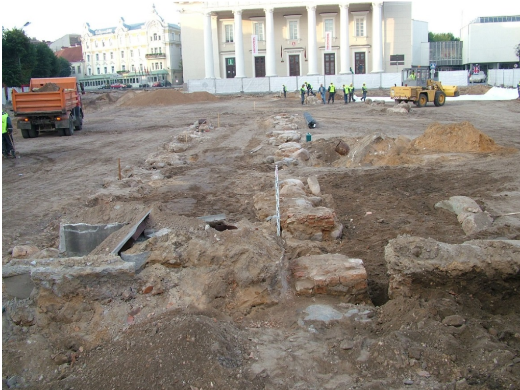
Figure 4. Archaeological Excavations at Rotušės Square, 2005