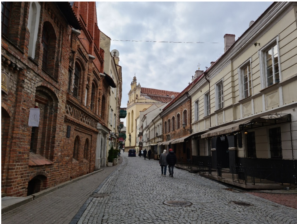
Figure 2. Pilies Street Segment and the Church of St John