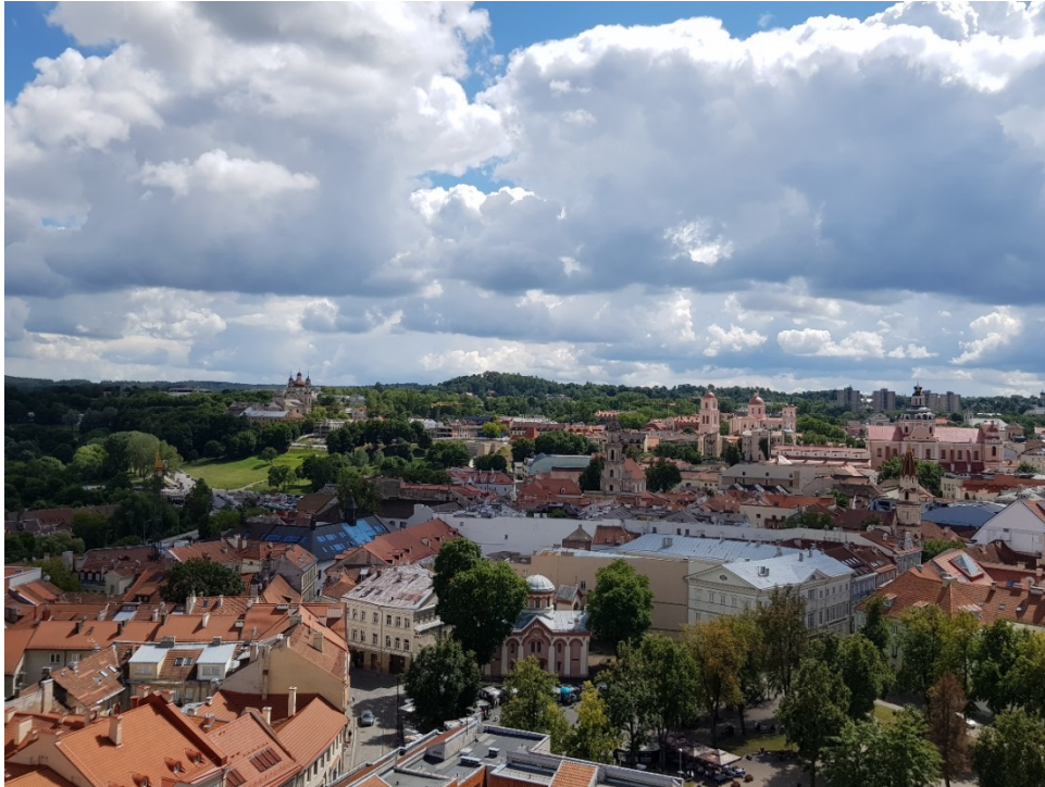
Figure 3. The Church of St Paraskevi and the Southeast Part of Vilnius Old Town

the same way, one of the earliest marketplaces could have stood near precisely this church in Vilnius. The importance of the site in the spatial structure of the new city is shown by the fact that roads from two directions, Minsk and Polotsk (present-day Belarus), intersect there. 58 In this way it is possible to date this segment of Pilies Street between the Catholic Church of St John and the Orthodox Church of St Paraskevi to the first half or mid-14 th century.