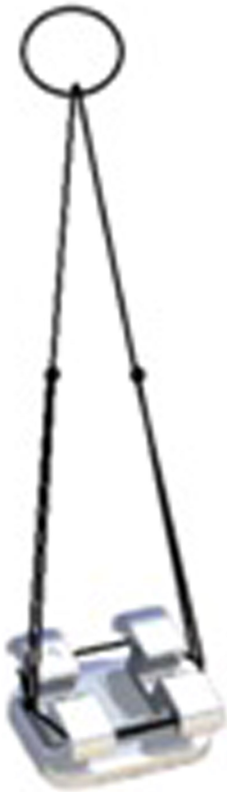
Figure 2. Application of the loops on the bracket.