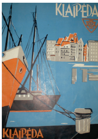
2. II. MEŠYS, J. Klaipėda. Vilnius, 1963.