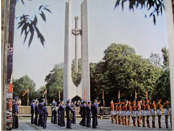
4 II. Monument Sword. The monument was built in 1975. The illustration shows that after 1980 Soviet symbols were not refused in information publications but their use was declining