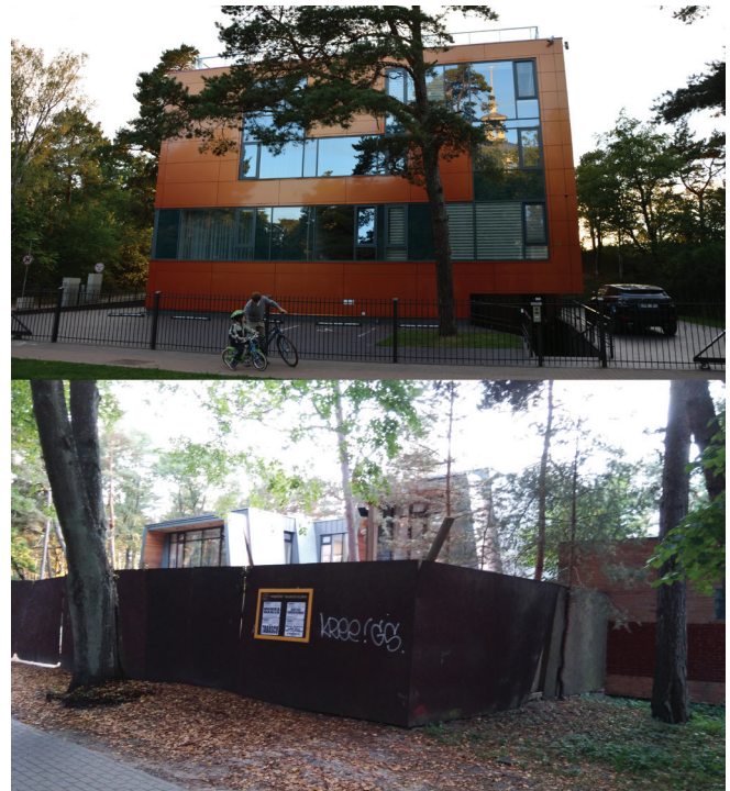
Fig. 3. New buildings in non-urban coastline.

During the urbanization of important areas of the resort, a large number of construction works were carried out at the expense of the former green zones, the city plots dispersed the planned Health Park, valuable greenery in the Green Square near Vytautas and Žvejų streets was damaged and disposed of. When the prefab line was privatized, the structures were meant for the service of holidaymakers, most of them were demolished, while the remaining ones were neglected and were no longer used for their intended purposes (Fig. 3). On the spots of demolition of the aforementioned sites, according to the approved projects, construction of new buildings began, which had little in common with the previous objects, and were of considerably larger volumes. Some buildings had a residential function, although in the projects the room functions are shown as serving the beach visitors.