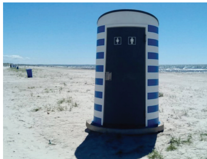
Fig. 6. Infrastructure in Liepāja beach.

of the most important urban elements of the city, and to getting meaning as a resort” [10]. The latter was not oriented to the restructuring of the territories but more to their explicit functional zoning and the development of recreational activities. To this day, the priority of nature remains important in resorts, it is also defined by legislation: “... the total area of recreational green areas per capita is 45 m 2 , twice more than in other urban areas” [6]. It is important not only to highlight the value of nature, but also to pay attention to preserving aesthetically most attractive landscape, which determines the attractiveness of recreational areas. Spatial development in resorts should be shaped primarily by revitalization of existing neglected territories, avoiding natural areas and unjustified urbanization of new areas.