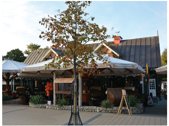
Fig. 8. The effect of visual pollution on representative architecture of Palanga resort.