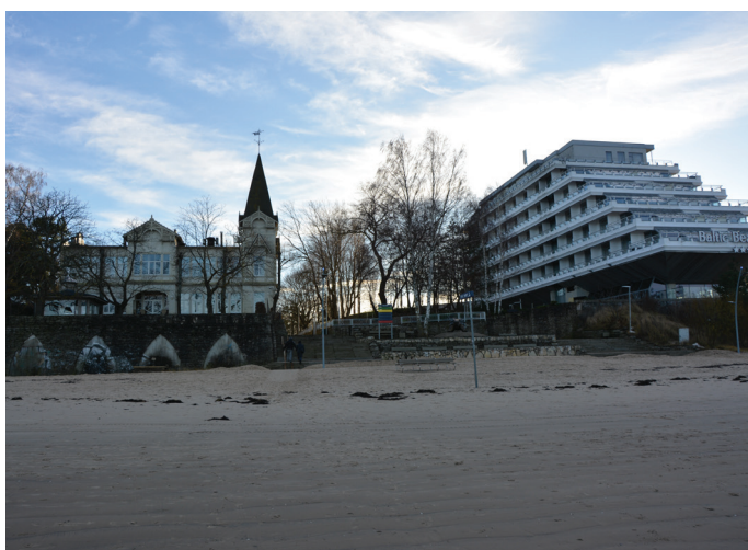
Fig. 4. Contemporary architectural forms change the recreational landscape. Jūrmala, 2017.

During the first decade of the restored Lithuania's independence, negative phenomena and causes in the Palanga resort urban trends were observed, especially the aspect of interaction of the new architecture and nature, which is one of the most important elements of Palanga: