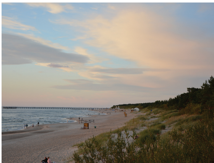
Fig. 5. Greenery in Palanga resort.