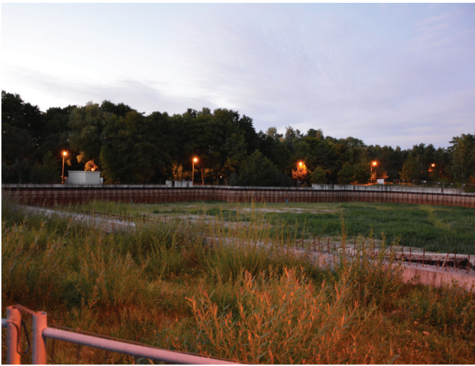
Fig. 7. Ruins of Jūrātė swimming pool in Palanga.