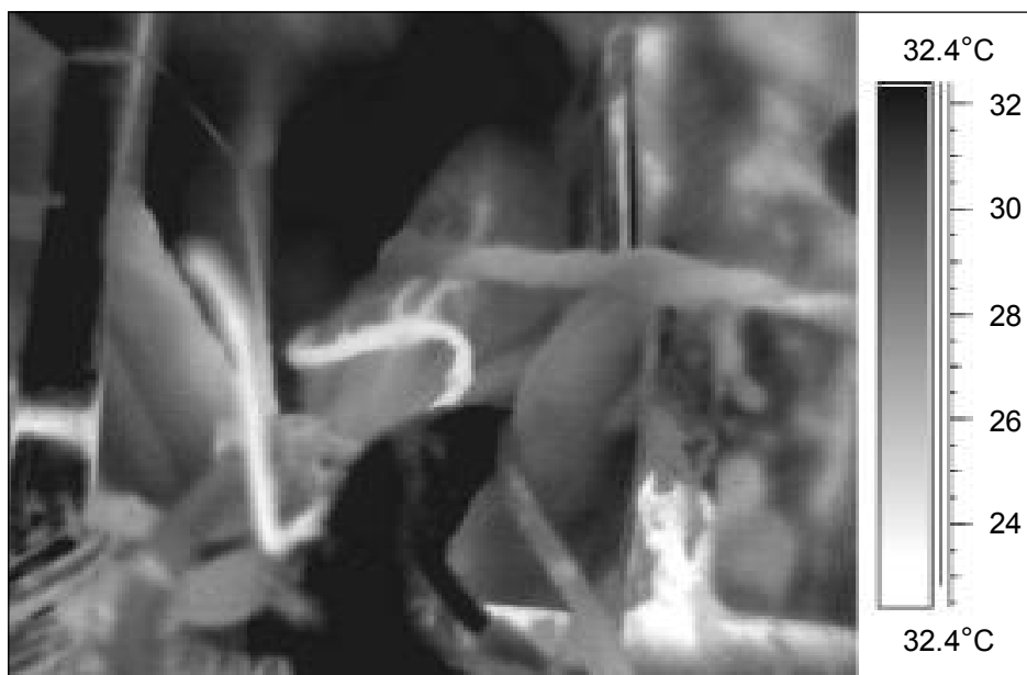
Fig. 2. Thermographic view of anastomotic areas and distal parts of marginal coronary arteries after suturing autovenous graft