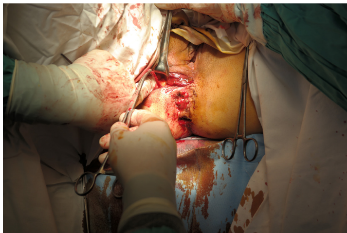
Figure 3. The muscle is threaded forward to the perineal area where oval incision is made and wrapped around the anus using additional small incision below the tip of the coccyges