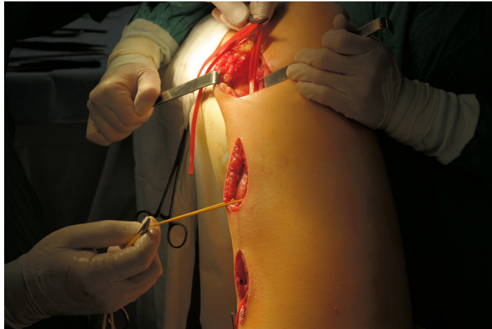
Figure 1. Short separate incisions in the right thigh are performed to harvest gracilis muscle